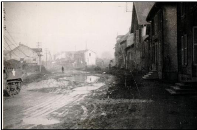
14 February, 1945