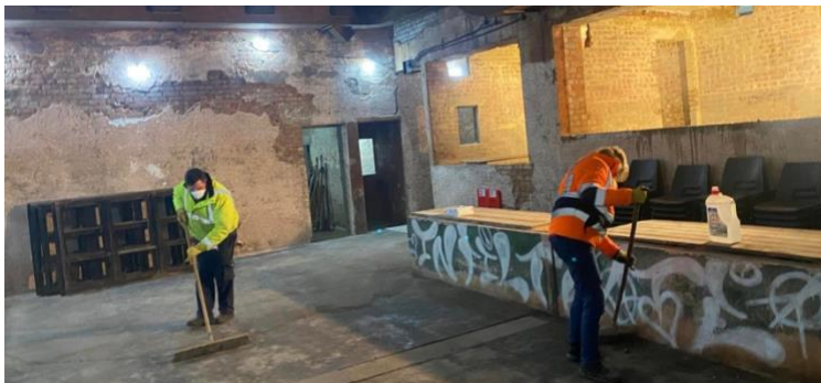
A recent look inside the Ops Building main hall, envisioned as a future event center and currently a main stop on museum tours.

open a Visitors Center as soon as possible. I must take this opportunity now to thank his Grace, the Duke of Bucleuch, Boughton Estates Management and Forestry Team for their support for us to realize this moment. I was determined to tell the story of the initial heavy bombing raids by the Americans of the 97th Bomb Group, originating from Grafton Underwood, also the Operations Block which would have witnessed all the planning and drama of the bombing of Berlin and D-Day and then to witness the final bombs of the 8th Air Force in World War II flying from this airfield and bring it back to life for visitors to experience."