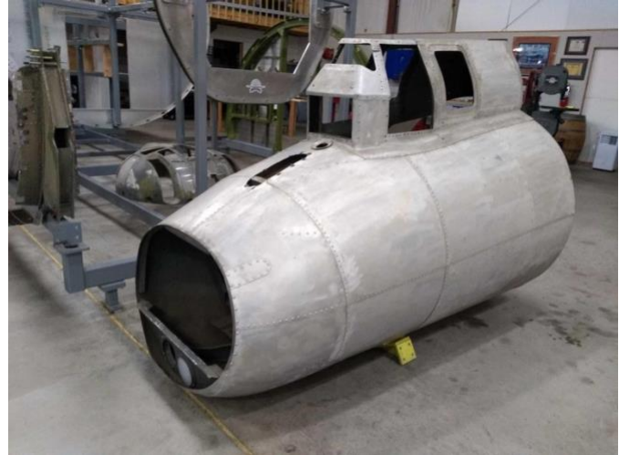
The “new” Lucky Thirteen stinger, after clean-up