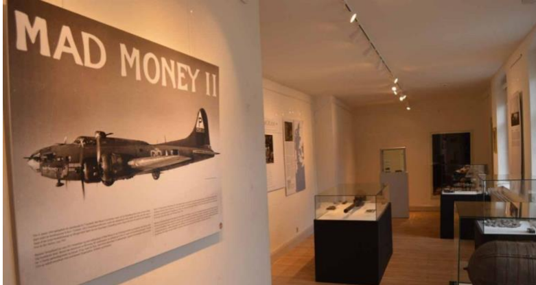
The Mad Money II museum display in Denmark.

The crew of Mad Money II , a Vega-built B-17F (42-5838) was one of the original 36 B-17s assigned to the 384th in May