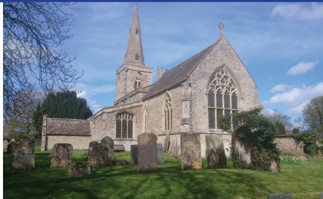
St. James the Apostle Church, Grafton Underwood, England