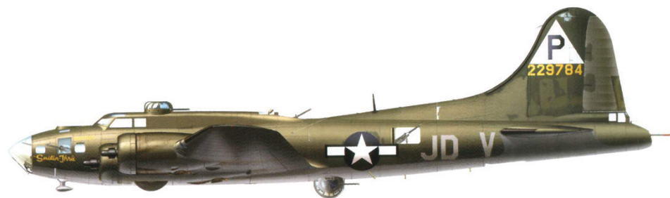
B-17F 42-29784 "Smilin' Thru", crashed in England Oct. 14, 1943 after 2nd Schweinfurt mission.