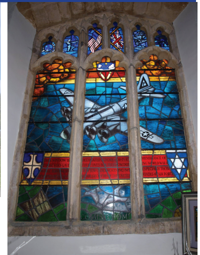
The original stained glass window from St. James the Apostle Church, Grafton Underwood England.