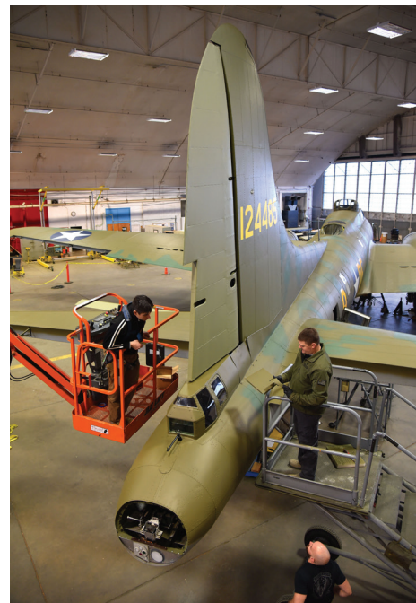
Memphis Belle restoration, Jan. 5, 2018

Holiday Inn Dayton/Fairborn I-675 2800 Presidential Drive Fairborn, Ohio 45324 United States Tel: 937-426-7800