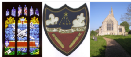
544 Bomb Squadron 545 Bomb Squadron 546 Bomb Squadron 547 Bomb Squadron

Ocala, FL Edgewater, FL Bella Vista, AR Baton Rouge, LA