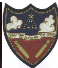
384th Bomb Group Grafton Underwood