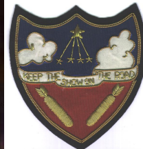
384th Bomb Group Grafton Underwood