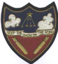
384th Bomb Group Grafton Underwood