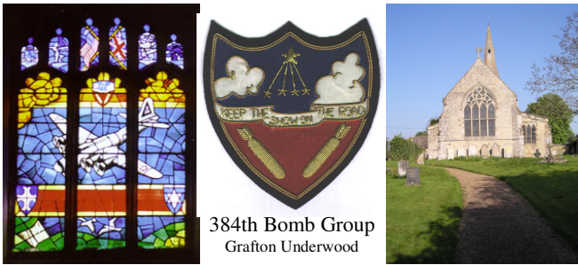
384th Bomb Group Grafton Underwood

Coffeeyville, KS Yakima, WA Tucson, AZ Marietta, GA Loxahatchee, FL