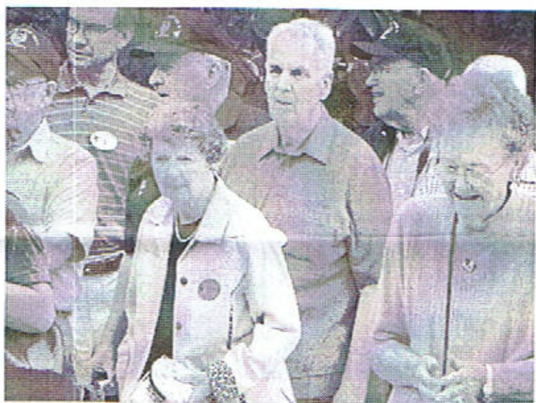
Members 384th on Tour