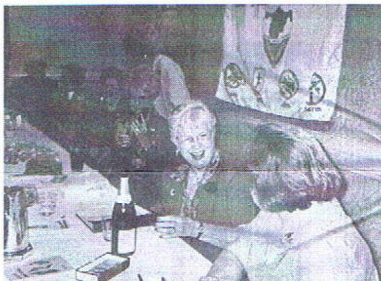
Ladies 384th Registration