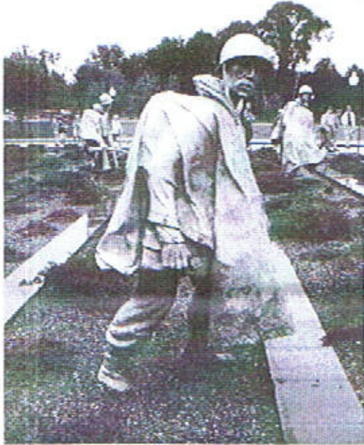
Korean War Memorial