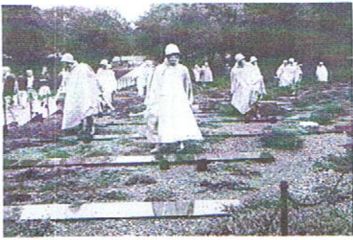
Korean War Memorial