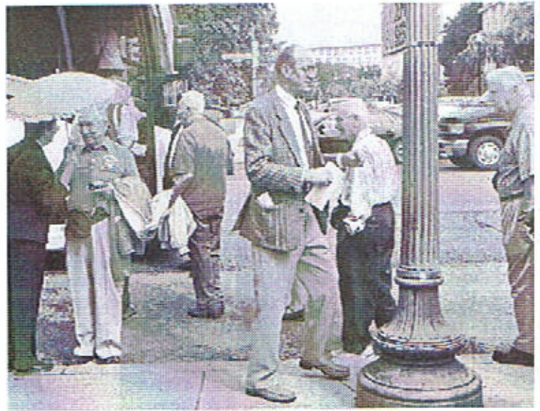
384th Members & Guests Boarding Bus For Tour