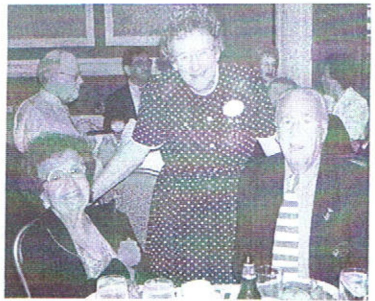
Happy 384th Members