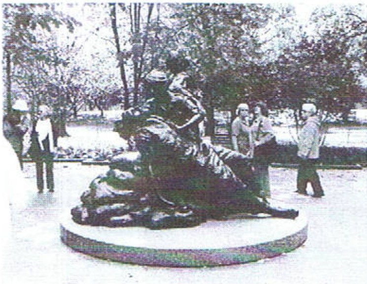
Memorial of the Nurses