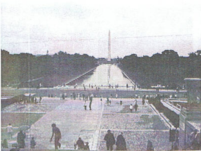
View up Mall from Lincoln Memorial

D-DAY JUNE 6, 1944 YOU ARE ABOUT TO EMBARK UPON THE GREAT CRUSADE TOWARD WHICH WE HAVE STRIVEN THESE MANY MONTHS. THE EYES OF THE WORLD ARE UPON YOU. I HAVE FULL CONFIDENCE IN YOUR COURAGE, DEVOTION TO DUTY AND SKILL IN BATTLE. GENERAL MARSHALL CENTRAL EUROPE