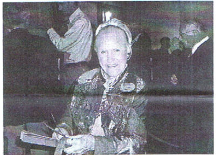
Anyone Know Who This Lady Is?