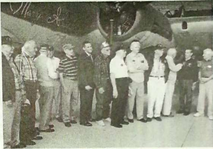
384th Members at Ducford Museum