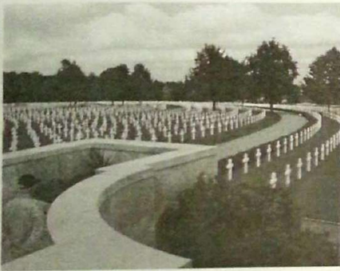
Mattingly Cemetery American