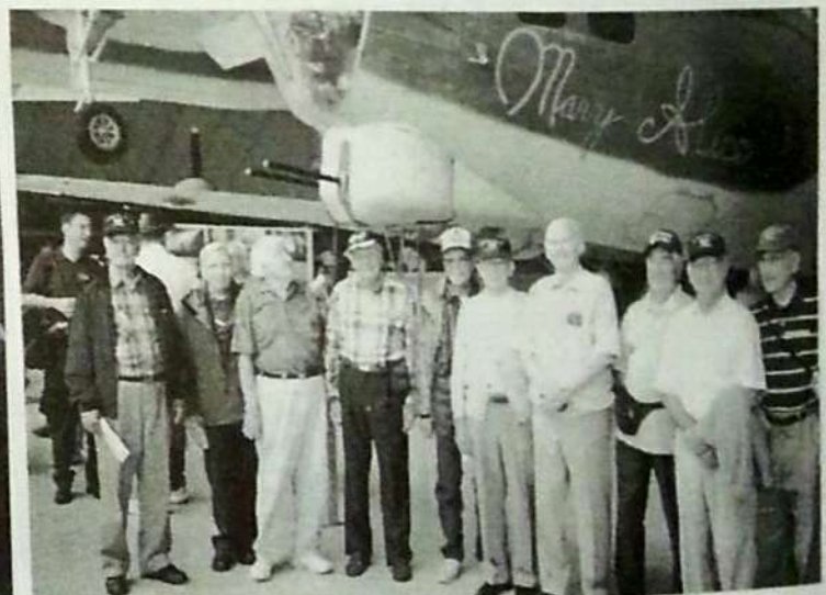
384th Members & B17 at Ducford