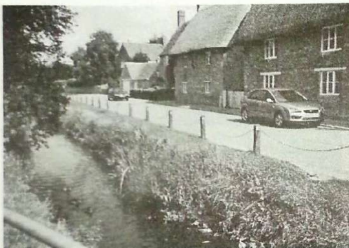
Street scene in Grafton Underwood, Eng.