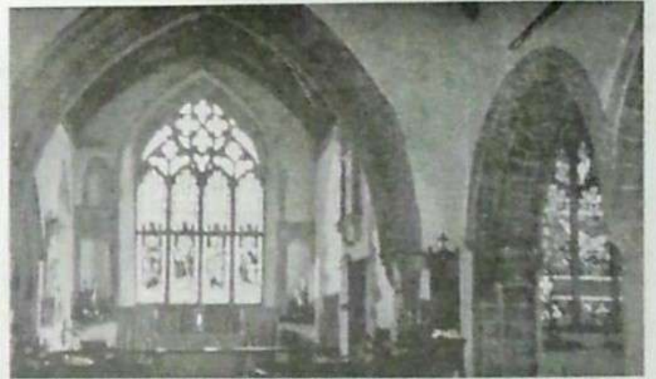
Church in Grafton Underwood