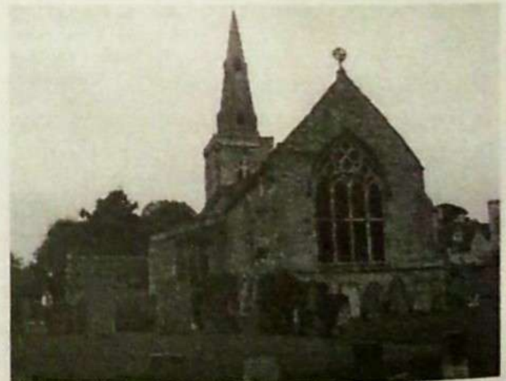
CHURCH IN ENGLAND

I hope the anniversary of this event is sufficiently acknowledged by the beneficiaries of your activities.