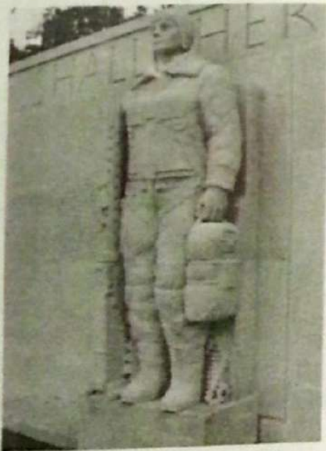
Wall of Missing Men at Mattingly Cemetery