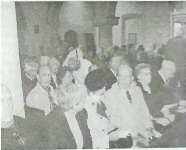
384th Members at Church Service