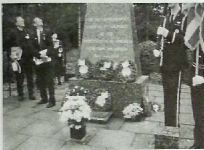
The invisible Fly-by - 384th Memorial Wreath Laying