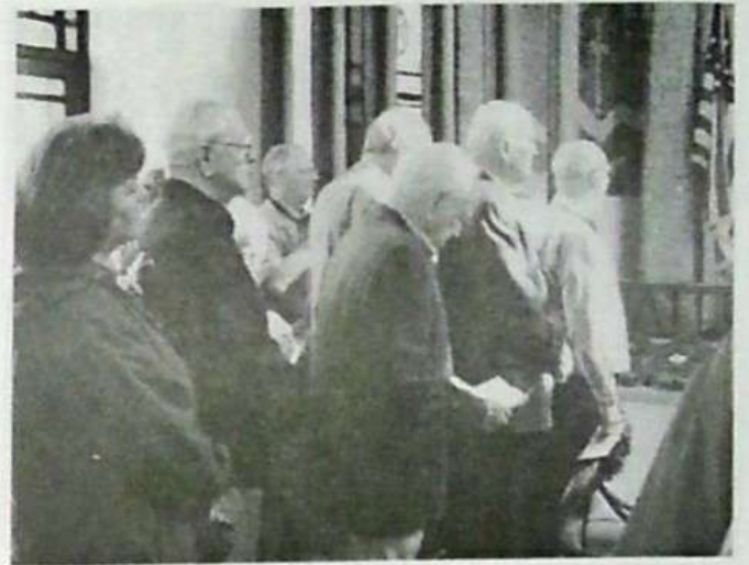
384th Members at Church Service