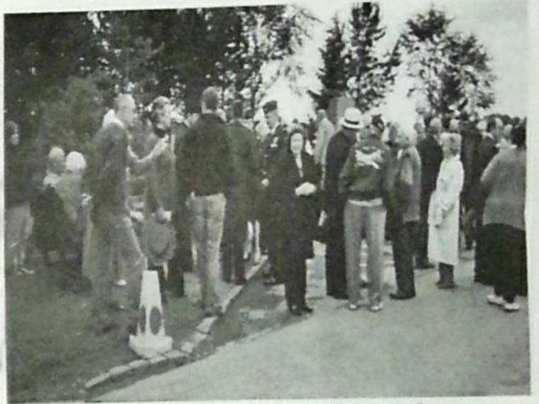
384th at Memorial in Grafton