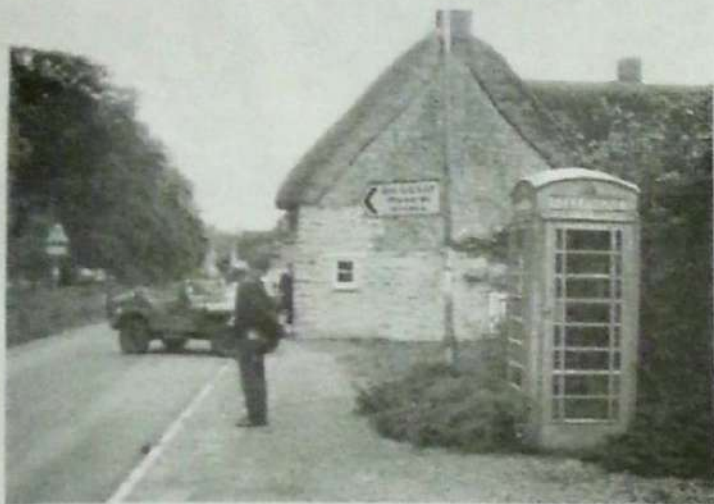
Village of Grafton Underwood, England Sept. 2005 No change in 60 Years