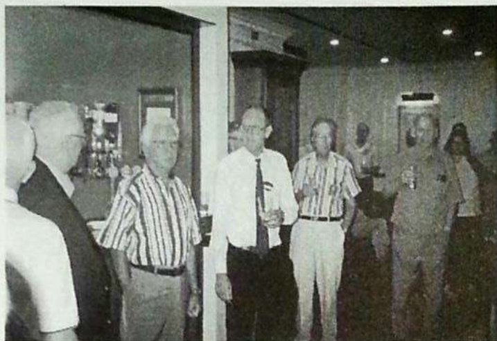
More of our 384th Members