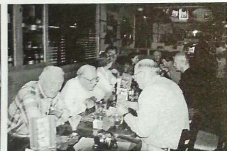
384th Members at Dinner in Italian Restaurant