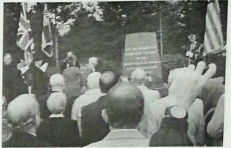
Memorial at Grafton