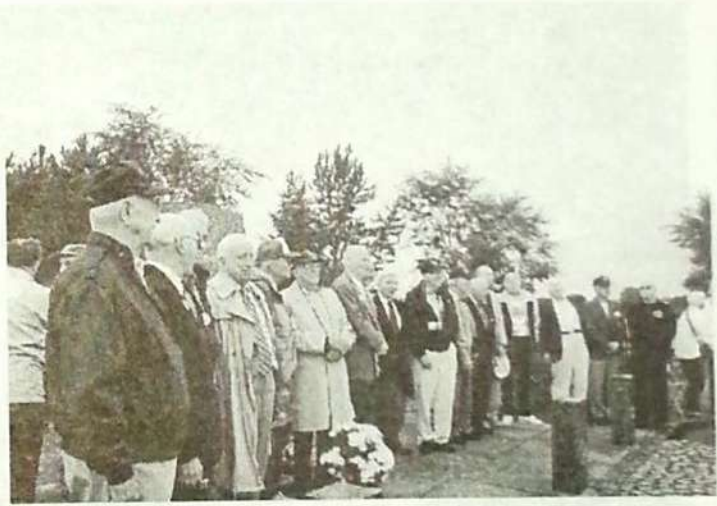
384th Members at Memorial