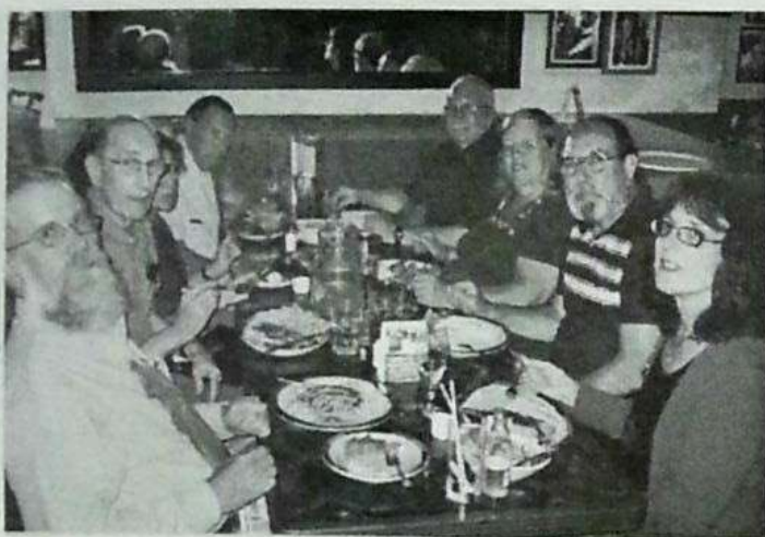
Group at Dinner