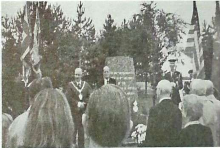
Memorial Wreath Laying Ceremony