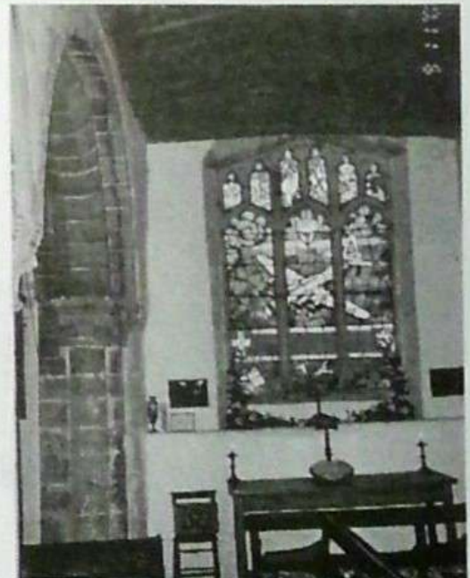
Stained Glass Window at Chapel in Grafton Underwood England 384 Base