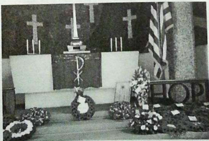
Chapel at American Cemetery-Cambridge