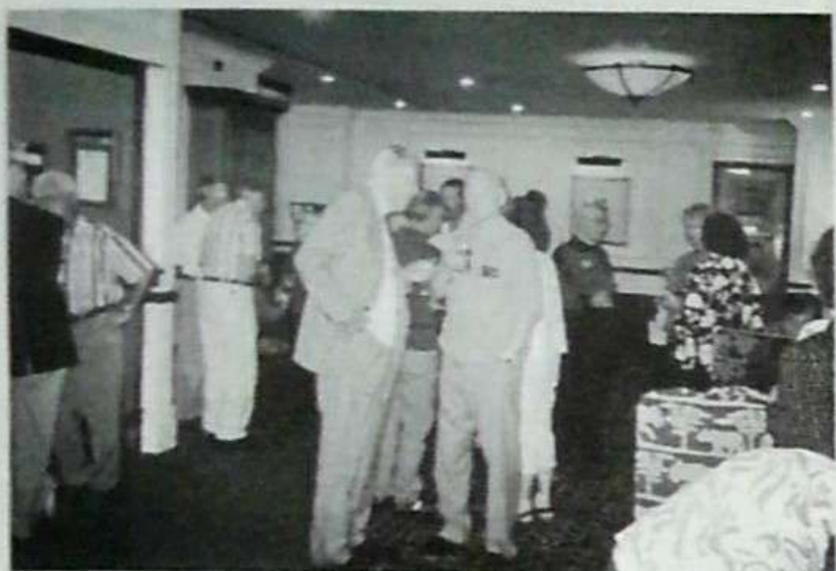
Enjoying Some Comaraderie