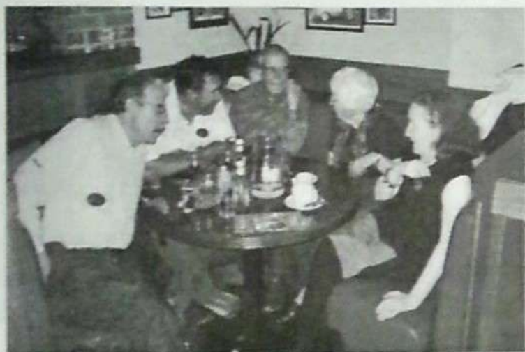
Enjoying Some Comaraderie