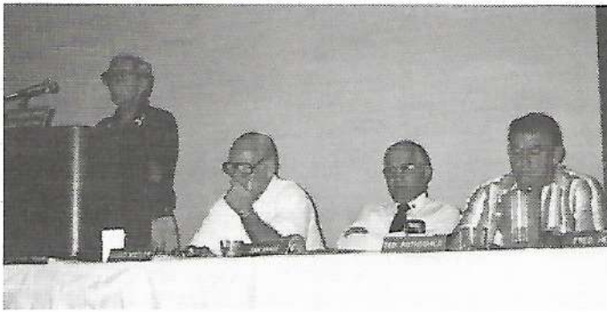
11th Reunion Meeting