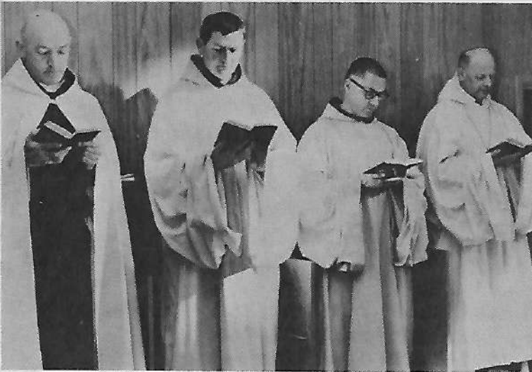
"My house shall be called a house of prayer."