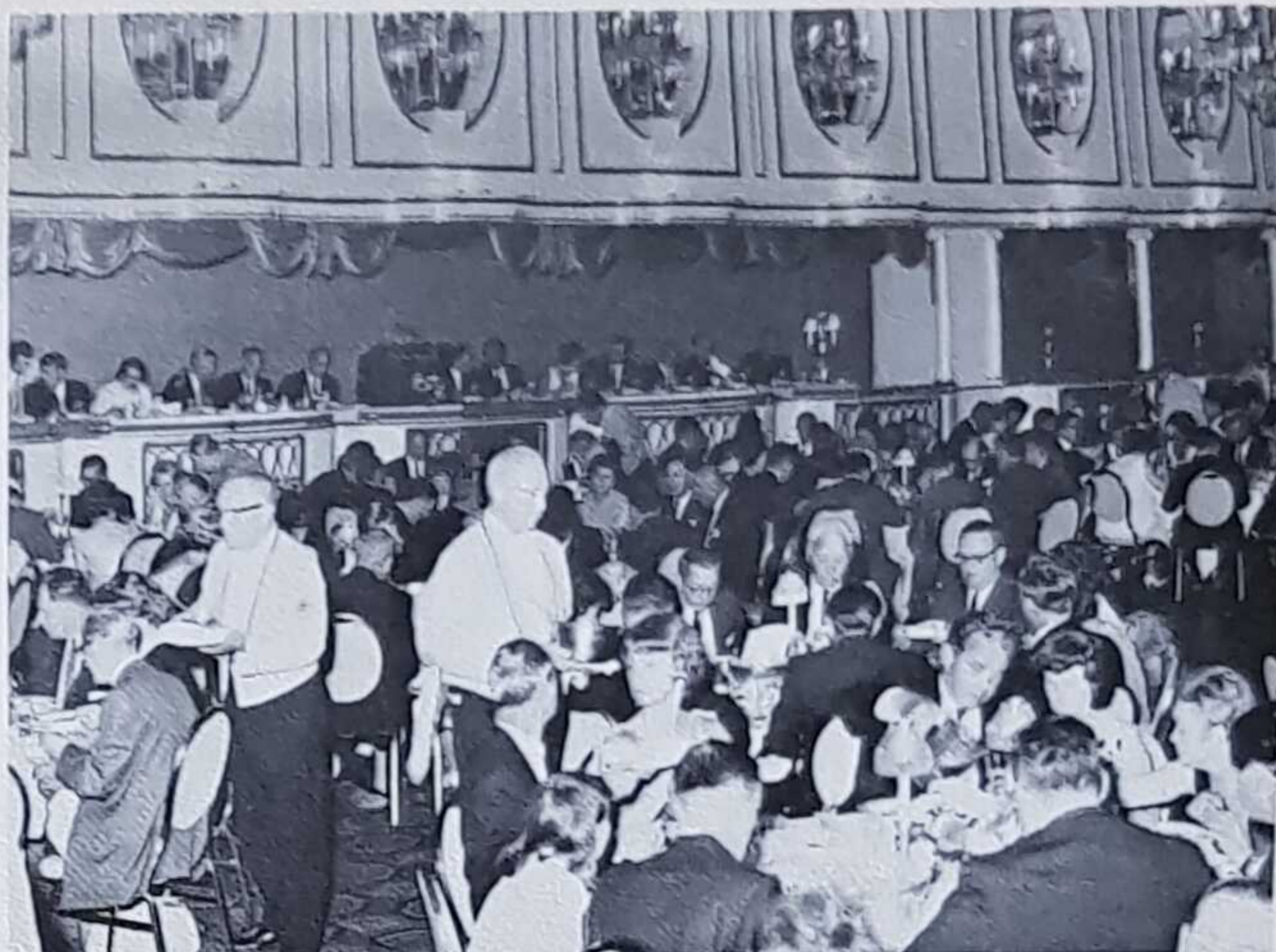
TIME TO DINE