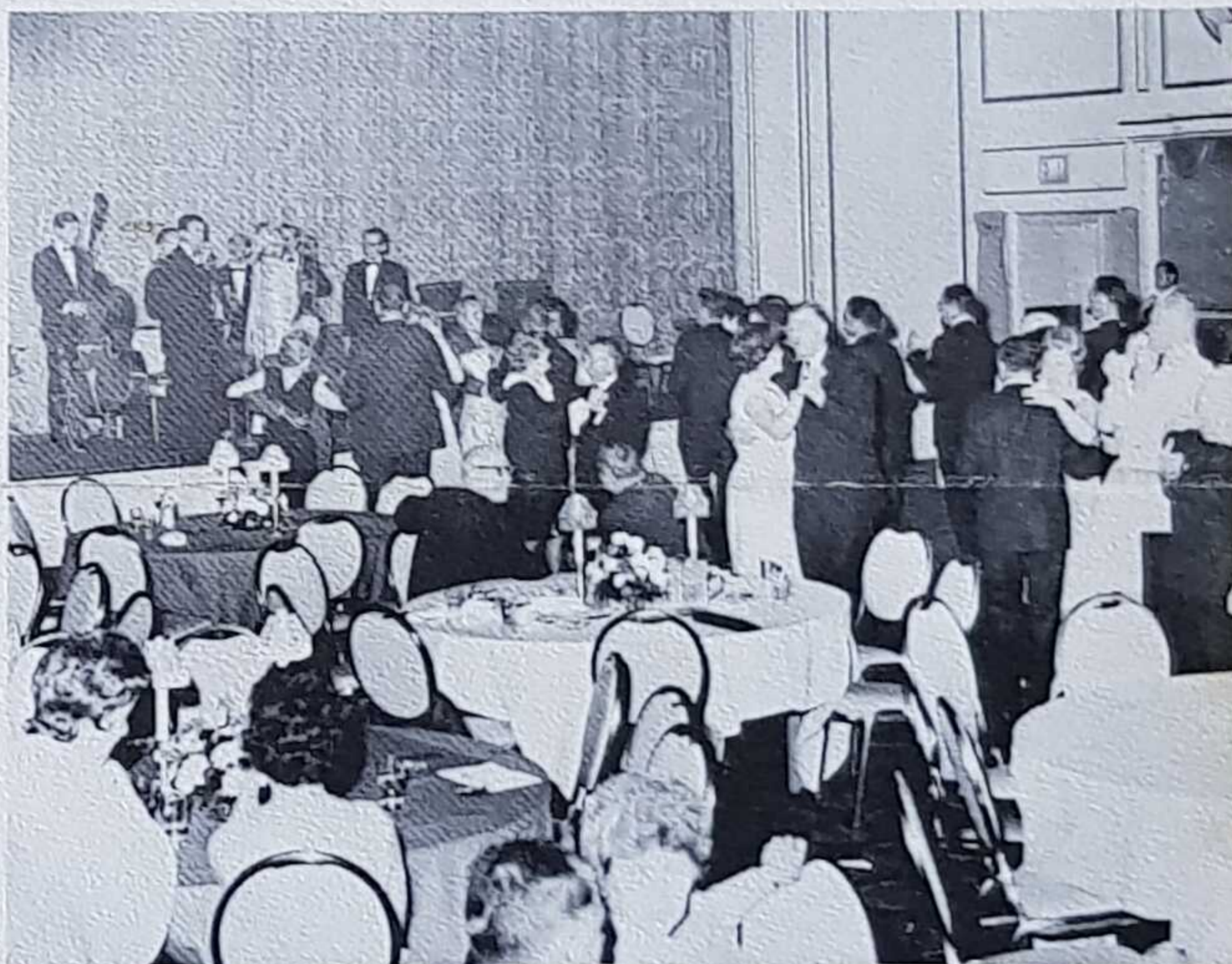
DANCING TO THE PLAYING OF 1941-1945 SONG HITS!

384th Bomb Group Reunion P.O. Box 1942 Ft. Washington, Pa. 19034