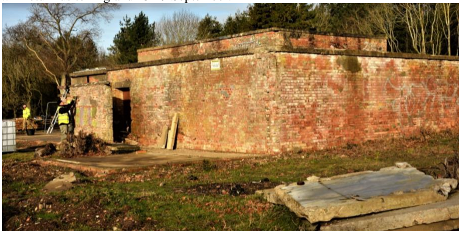
This recent photo shows progress at the 384th museum site at Grafton Underwood. For more on the work there, please see story, Page 4 .

The reunion begins 13 September with a coach trip from a hotel near Heathrow Airport at lunchtime, traveling to our headquarters hotel, the Hilton Cambridge City Centre. All events originate there and accommodations are included in the reunion fee, is £1,725 per person (double occupancy). If not sharing accommodations, a "single supplement" of £625 is charged, making the total for solo attendees £2,350. This covers meals, transportation, and our professional tour manager, former RAF pilot Rick Hobson.