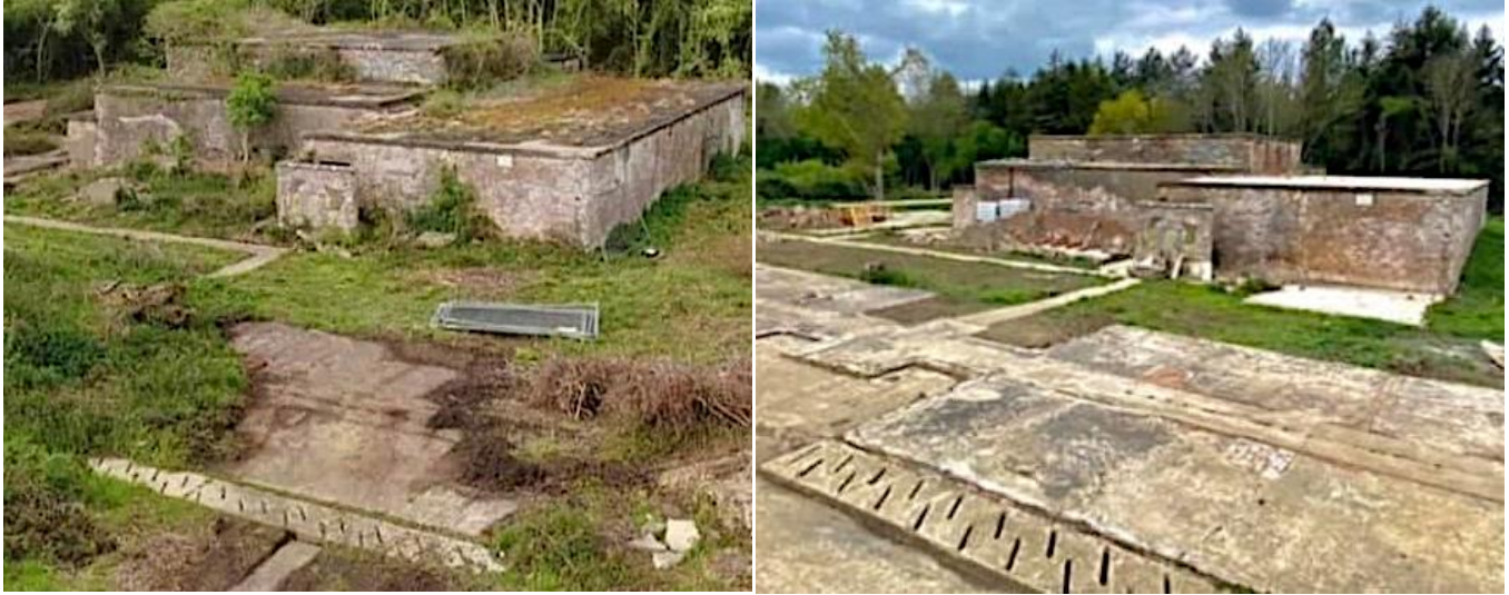
Before (left) and after (right) pictures of the Operations Block at the 384th Bomb Group's former Grafton Underwood home, showing progress made in clearing vegetation and shoring up the building itself and surrounding areas.

The 2022-2023 winter in the United Kingdom has been unpredictable. By turns cold, warm, wet and sunny, it has not deterred volunteers with the Friends of the 384th in preparing the museum site at the 384th's Grafton Underwood home.