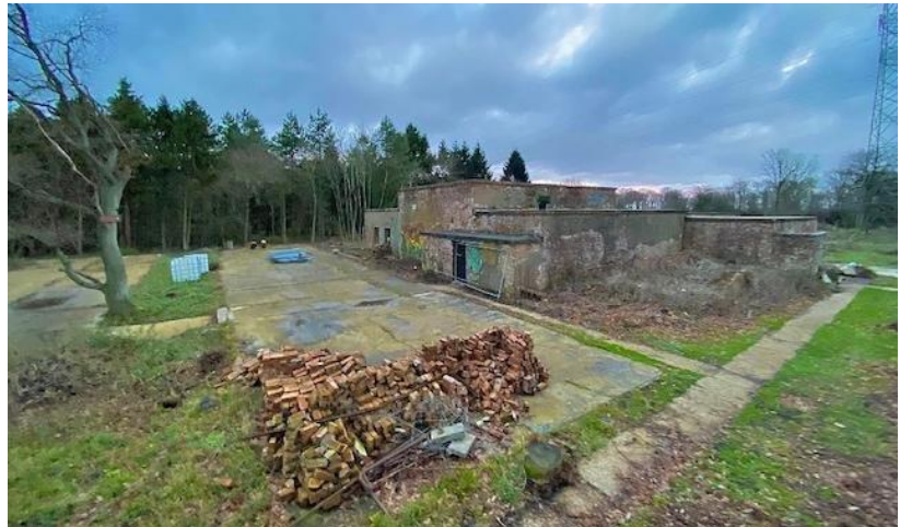
The Operations Block, after much clearing by the Friends, early 2022